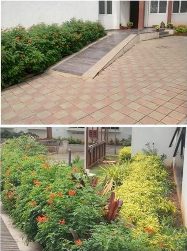
Figure 7-4: Plantation near ladies hostel