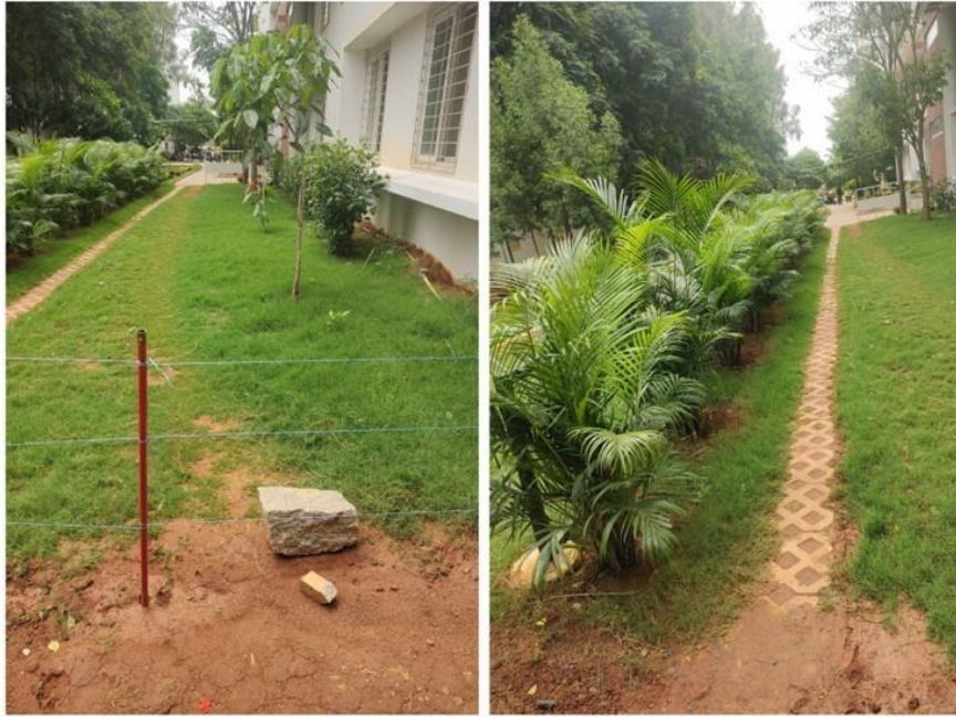
Figure 7-3: Lawn area