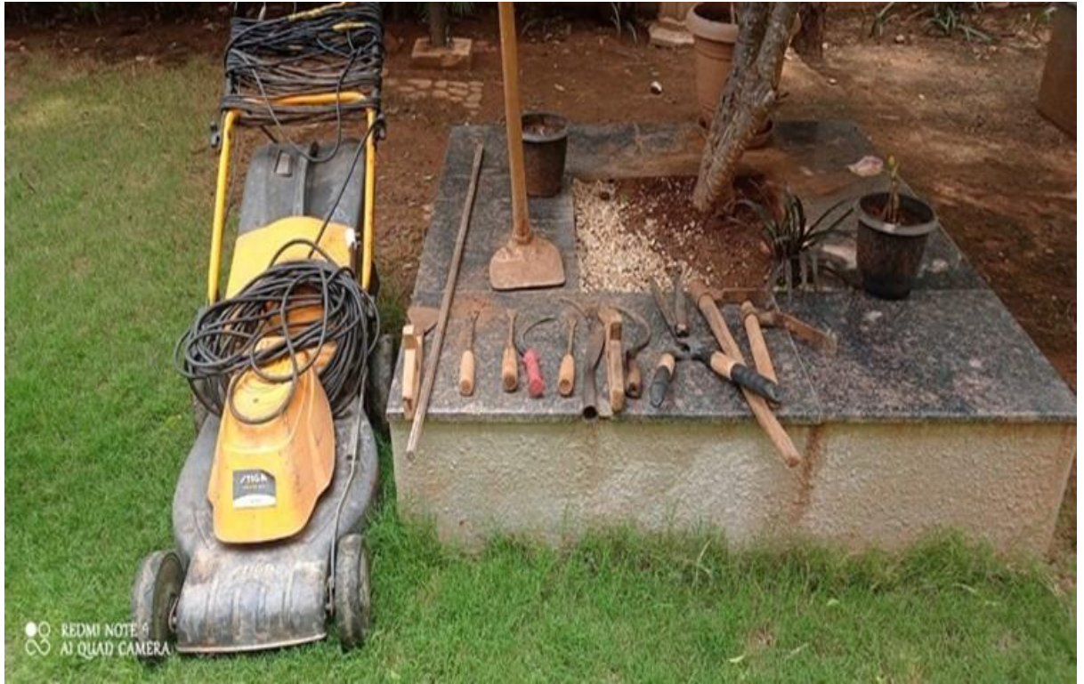
Figure 7-5: Garden Maintenance Tools

The greeneries within the campus are maintained properly with dedicated garden maintenance staff. They proper maintenance like weeding, lawn care and watering etc., The sample image of garden maintenance tools is shown in figure 7-5.