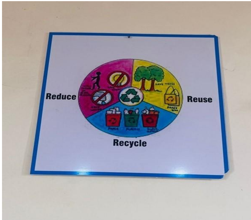
Figure 7-6: Awareness poster

The sample images awareness posters are shown in figure 7-6.