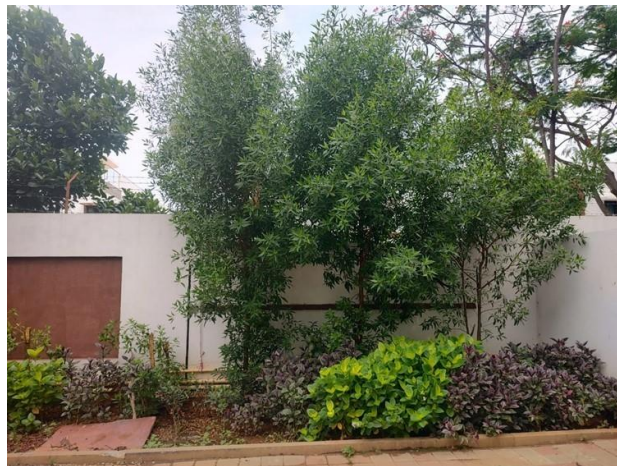
Figure 7-2: Plants in the college campus