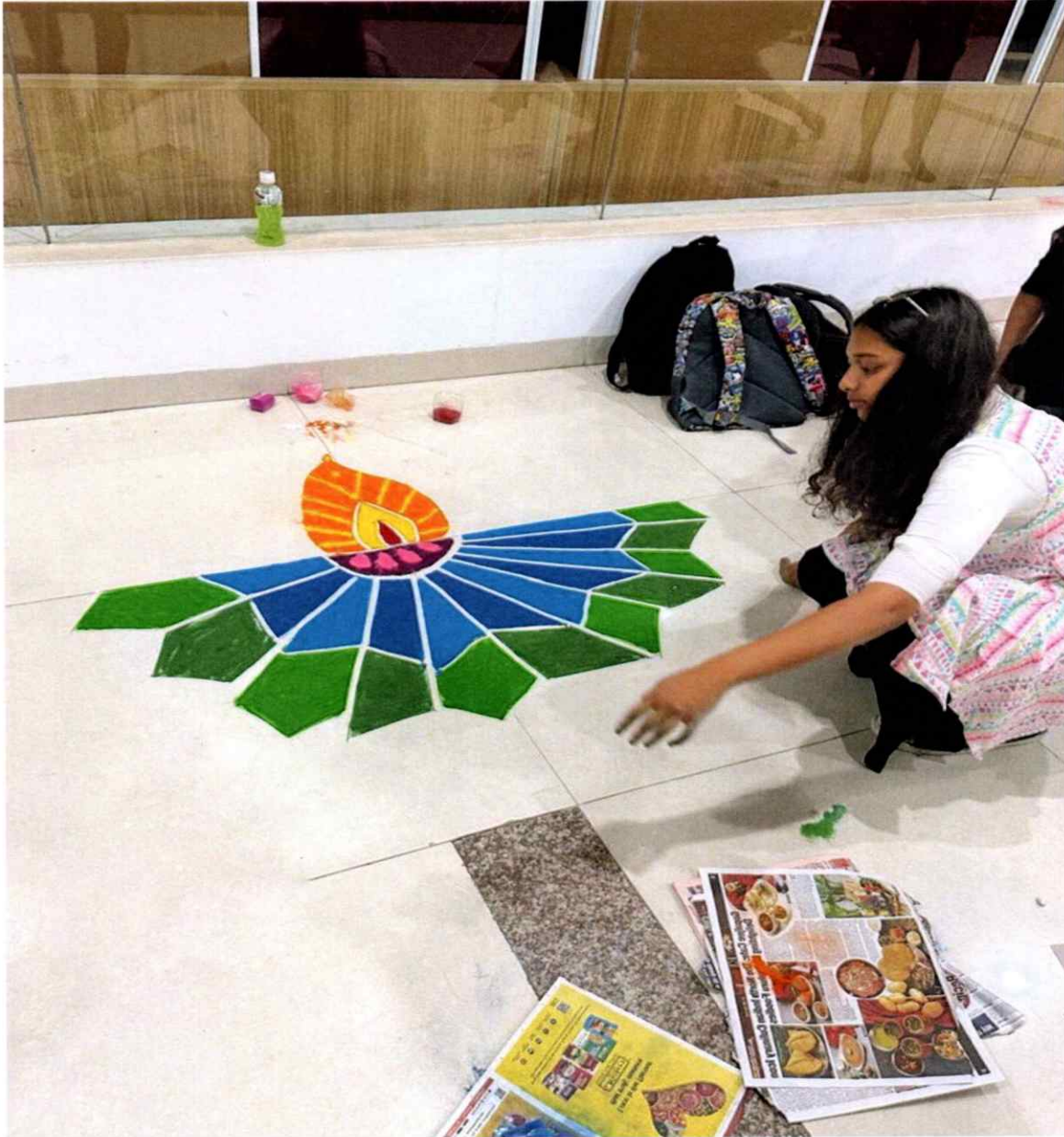
Students participated in rangoli