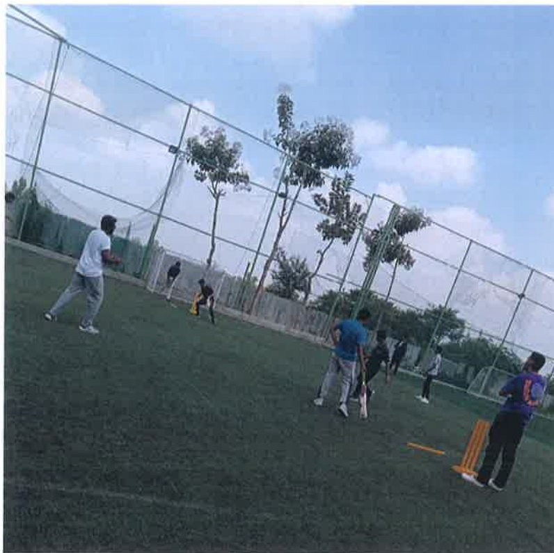
A highly contested match was played at Sport zone.