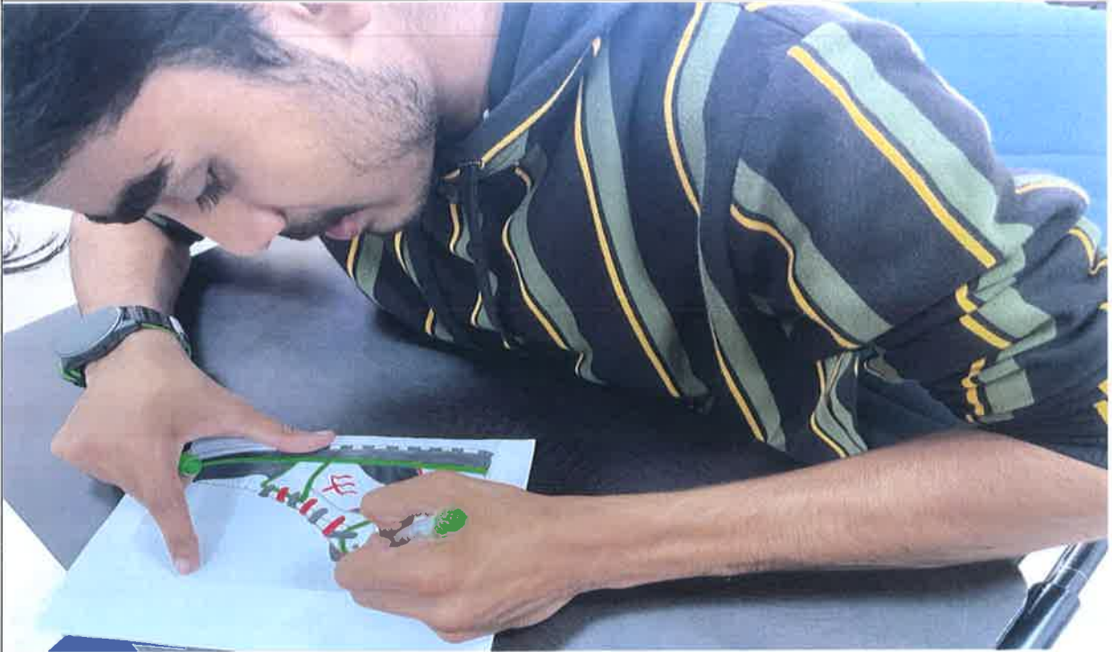
Students participating in Sneaker Doodling