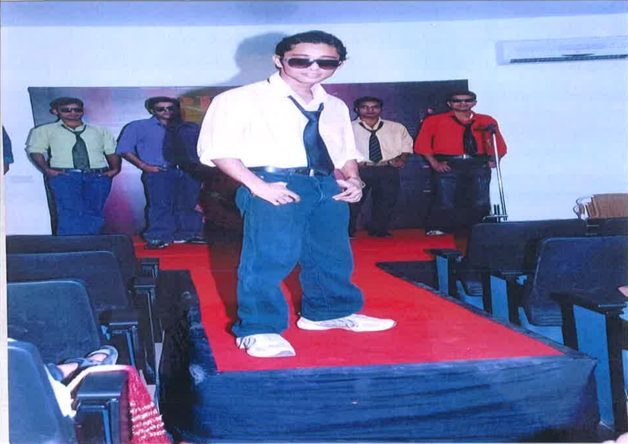
Retro-themed Fashion Show