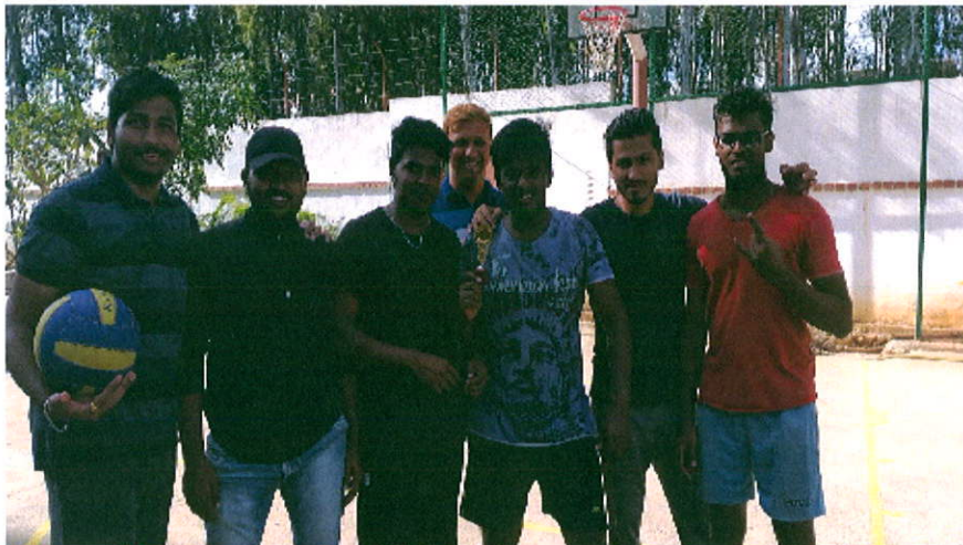
Intra Class Sports Tournament of UG Department on 8 th September 2018 at ISME Bangalore