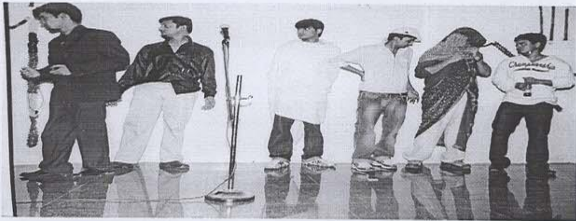
Activity: Stage Fright