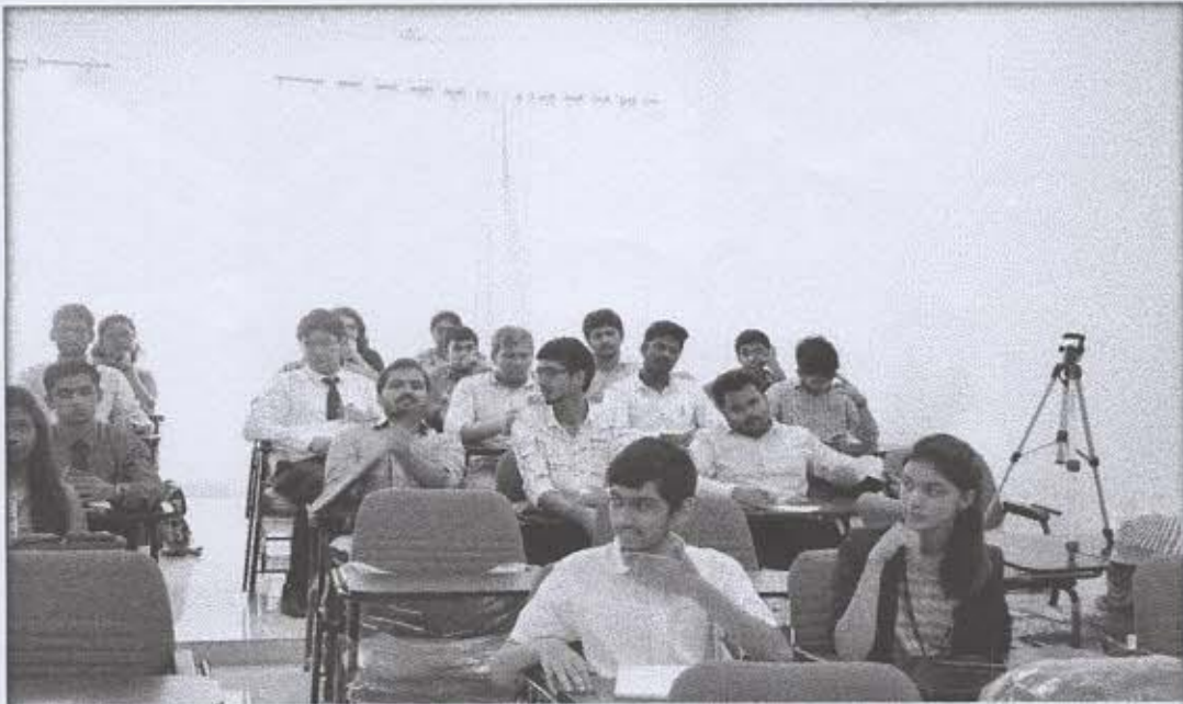
Training on Aptitude Tests & GDs Session- Aptitude Training