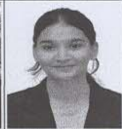
Test Day Photo