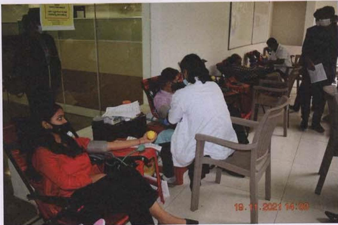
Blood Donation Camp in ISME